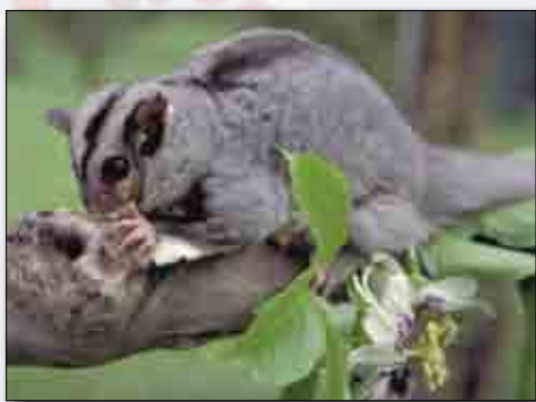
Mahogany Glider

The effect of the cyclone was felt over a huge area from Cooktown down to the Whitsundays and a long way inland. The northern part of the Wet Tropics World Heritage Area escaped relatively lightly. However, the area from Innisfail to Ingham took the full force of the very destructive winds and there has been significant damage to vegetation in the Mission Beach, Tully, and Cardwell regions.