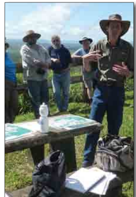
Stakeholders discussing the project design on country

So when the Australian Government's Caring for Our Country Business Plan 2010-2011 identified 'Mobilising landholders to improve landscape connectivity in the Wet Tropics'