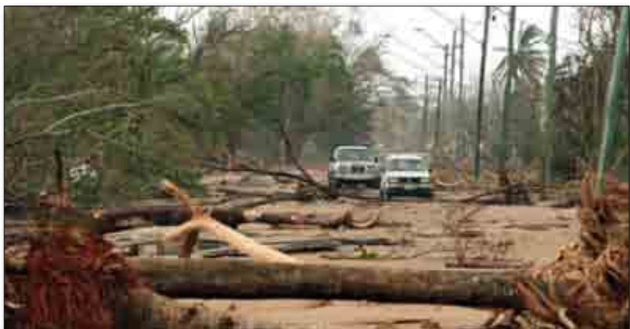
The Bruce Highway blocked after a tidal surge hit the town of Cardwell following Cyclone Yasi crossing the coast.

The Girringun Aboriginal Corporation, Camu Community Cooperative Service and the Local RSL, have also provided food, clothing and general support to the community of Cardwell and surrounding areas.