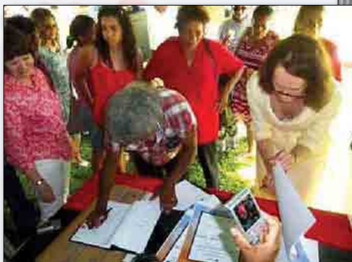
Above: Signing the historic lease agreement