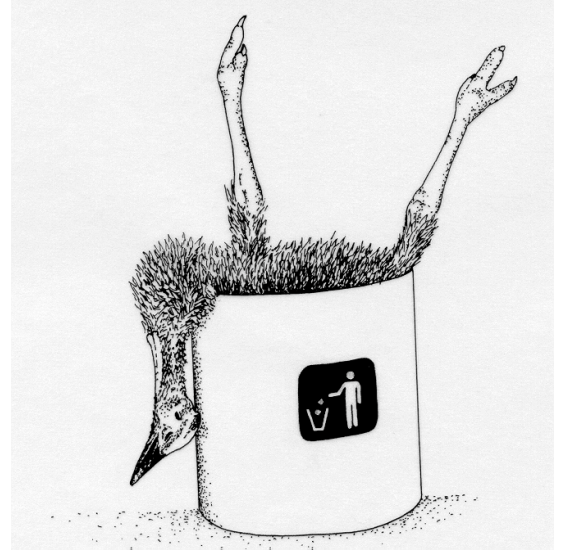
Dead cassowary chick