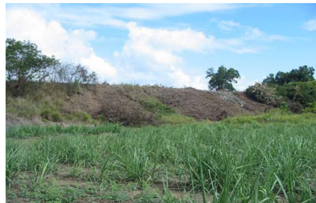
Hiptage weed management - before and after